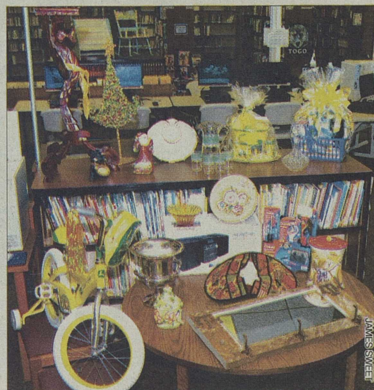
Pictured above are some of the items that the Eagle Lake Study Club will have up for grabs at their annual auction.